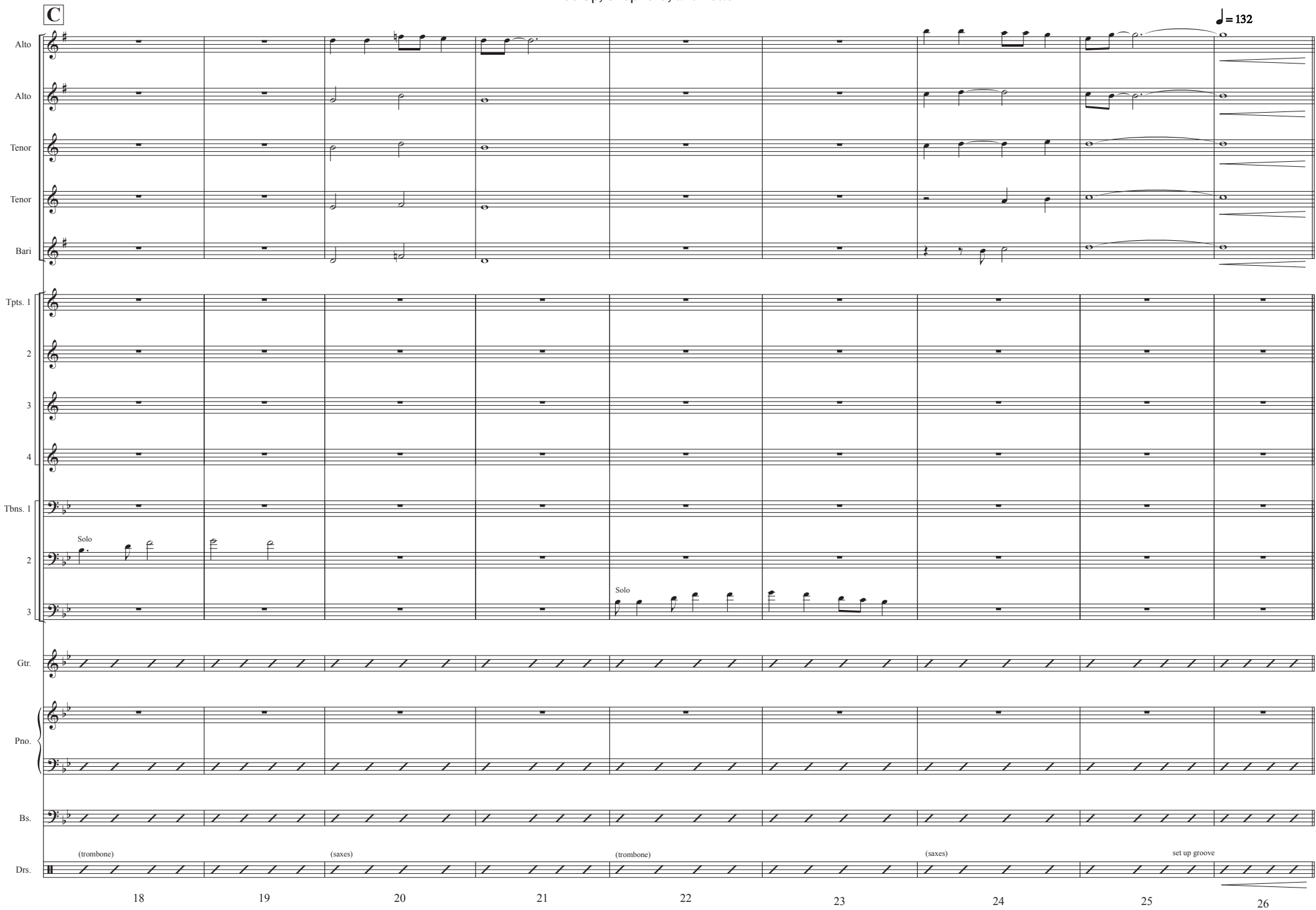
Rise Up, Shepherd, and Follow