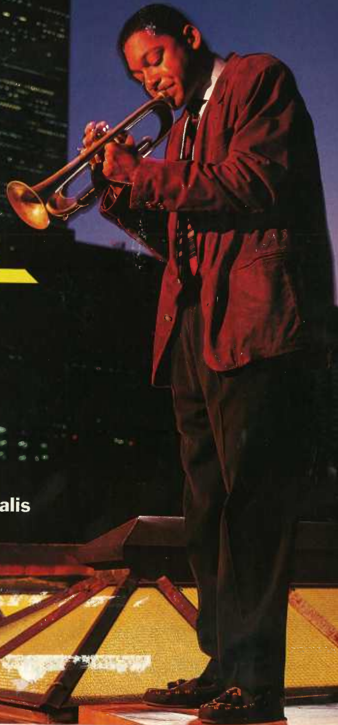
Trumpet master Wynton Marsalis